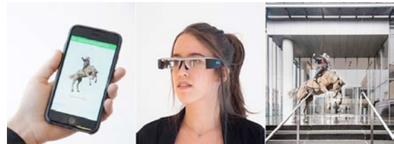
Figure 1. The NeverMind app (left) handles user interaction, the headset (middle) displays the information, the user sees the content at their current location (right).

NeverMind is an Augmented Reality system that enables a user to use the spaces they are familiar with to build their own memory palace and memorize lists of items.