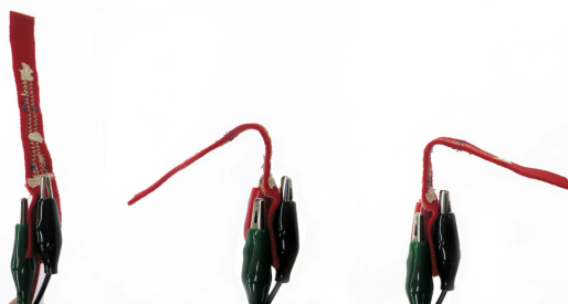
Figure 3. Two-way actuation

For our first prototype, we developed a Teflon and SMA spun yarn in which the SMA is actuated to curl the fur strand down, while the yarn's internal structure forces the strand back up to its original shape. In spite of being electrically insulated and fire retardant, the Teflon yarn is affected by increasing hysteresis and over time it starts to 'learn' and retain the shape of the SMA, losing strength to counteract the actuation force of the alloy. In an attempt to address this problem, we also experimented with different knitting techniques and a composite consisting of SMA, Teflon-wool yarn and polyurethane. The polyurethane in this case was chosen because of its tensile strength and capacity to return to its original shape after deformation. However, this technique proved to be impractical, since the balance between the materials' strength was hard to control and could not account for variations in fabrication and use.